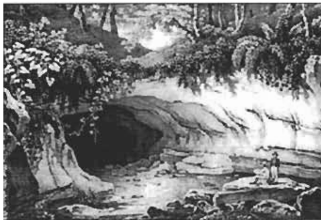
Fig. 2 - 'Une Grotte du quartier de la grande rivière (Ile Maurice)' by de Sainson - first published illustration of a Mauritian Cave.

South of Petite Rivière on Plaine St Pierre lie the Trois Cavernes, caves of considerable historical interest because FLINDERS (1814) recorded that the largest was used as a refuge by escaped slaves in the 1770s, over fifty having been caught there on one occasion by police. He recorded that "little oblong enclosures, formed with small stones by the sides of the cavern, once the sleeping places of the wretches, also [still] existed, nearly in the state they had been left" (FLINDERS 1814). MIDDLETON (1995, 1996c) believes some of these stone arrangements persist to this day. Nearby, at Xavier on the Black River road, in January 1997, a bulldozer driver broke into a lava 'blister' or hol-